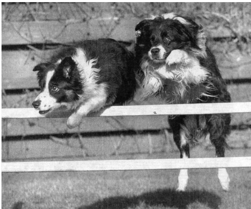
One jump ahead: a new company is offering breaks with a difference for canines in Scotland