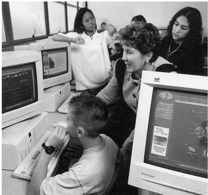
Screening room: Students using computers from ZapMe at a high school in California

ZapMe, which was officially launched last month, has put new PCs into about 70 schools and plans to be in 200 by the end of the year. But the computers can be used only with the ZapMe Netspace, a